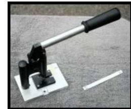
Optional Tape Slotter

Roovers Metal Tape Embossing Machines are economical solutions for creating small quantities of embossed or debossed metal tags. Using a character selection wheel, characters are embossed one at a time by pulling a handle. When the tag is completed, simply move the wheel to the FINISH position and the unit adds a blank margin at the end of the tag, cuts the rounded ends, and punches a hole. The tag then exits from a chute, ready for attachment to your product. An optional slotter is also available to punch slots in the tags for attachment with banding.