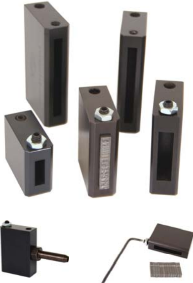
Each type holder is held in the press by use of an included shank.

Type holders are an easy way to stamp multiple characters at one time. Single line, multiple line, and custom holders are available to suit your application. Designed with drilled and tapped holes especially for use with Mark-First® presses, individual pieces of type are held in place with a simple set screw.