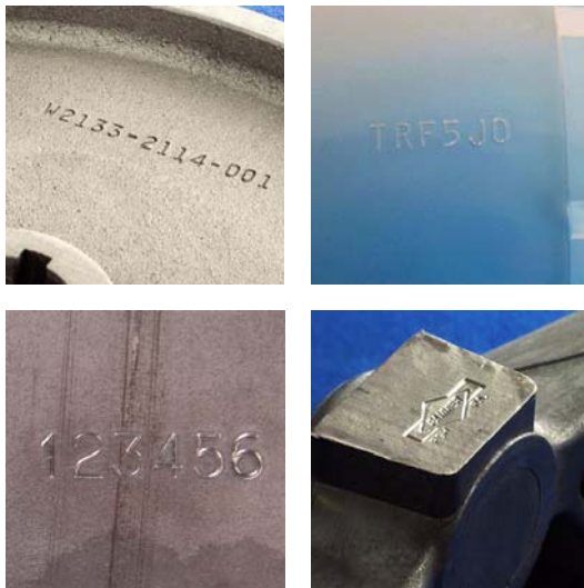
Mark part numbers, date codes, and logos on materials such as metal, plastic, wood, and even paperboard.