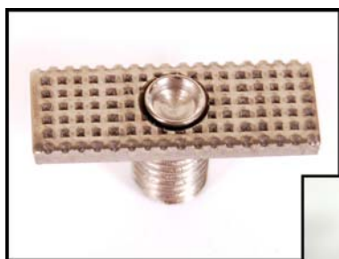
Use one press for marking (right) and for press-fitting parts (above).

The Mark-First® manual presses are a simple, economical solution for low volume benchtop marking applications. The presses are actuated with a pull of the handle.