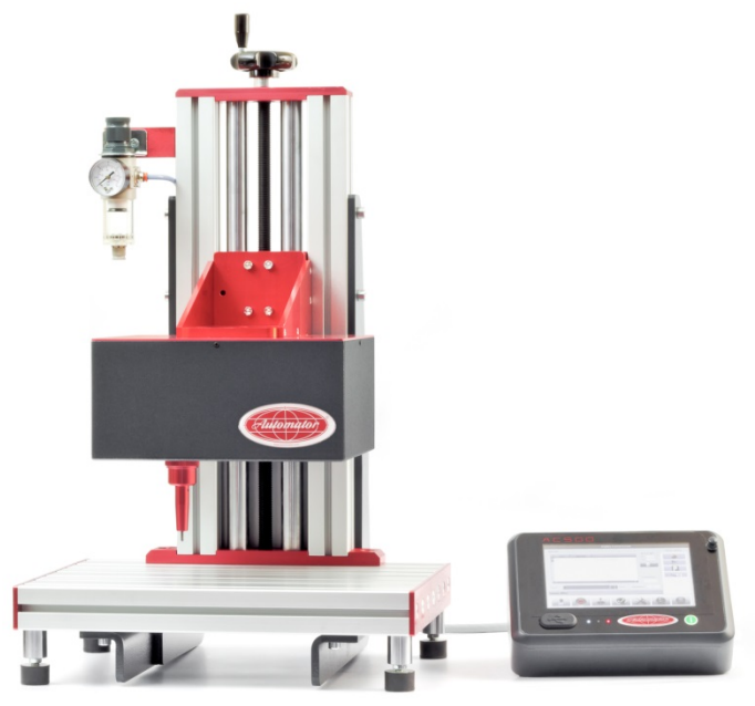
Benchtop marking system.