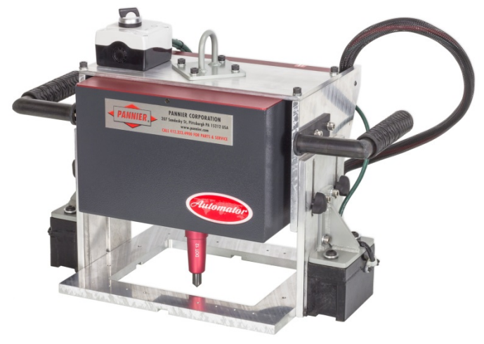
Portable marking head with electromagnets.