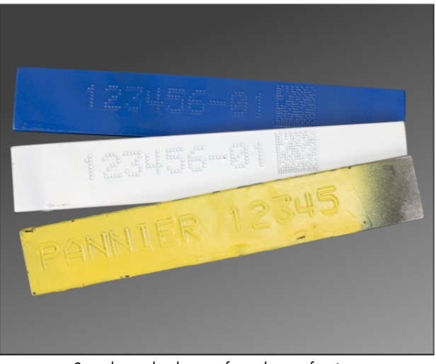
Sample marks shown after a layer of paint.